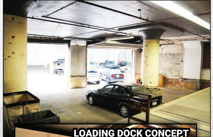
LOADING DOCK CONCEPT