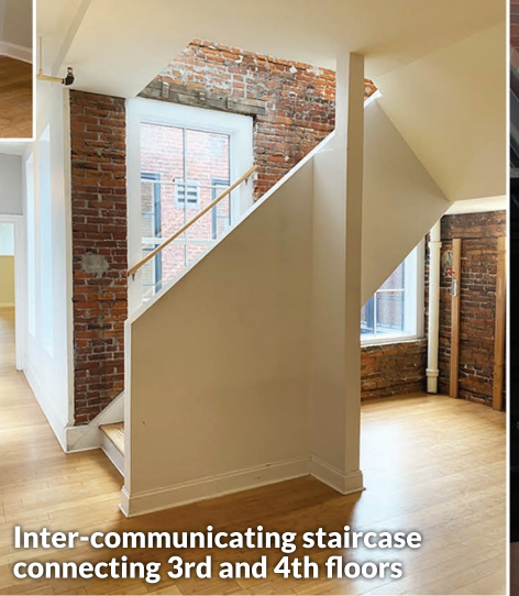
Inter-communicating staircase connecting 3rd and 4th floors