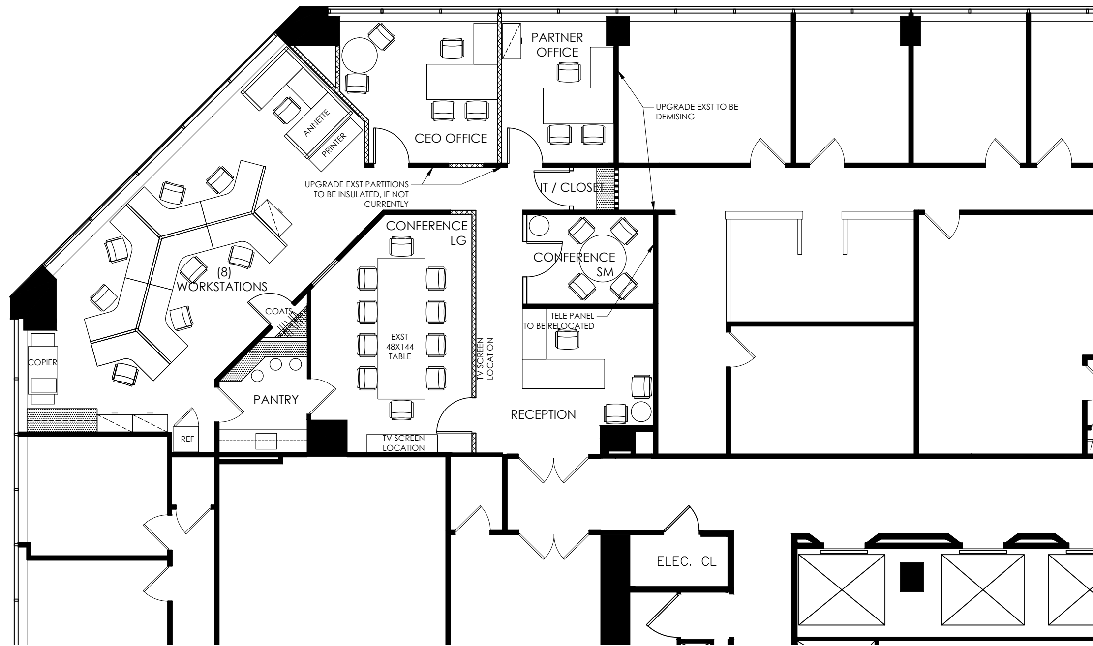
1 SCHEMATIC PLAN SK SCALE: 1/8" = 1'-0"