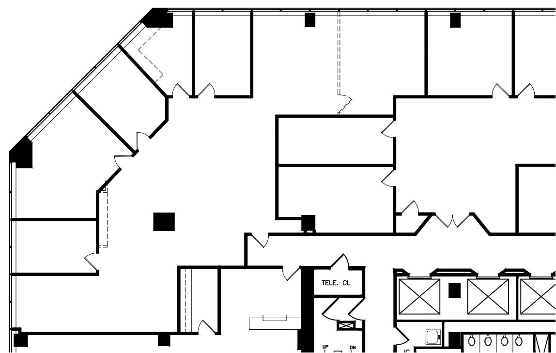
2 DEMOLITION PLAN SK SCALE: 1/16" = 1'-0"