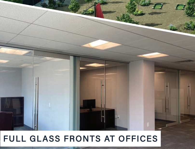
FULL GLASS FRONTS AT OFFICES